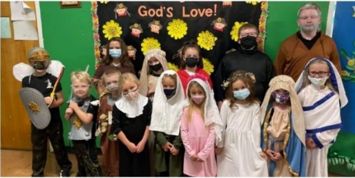
Upstairs and their All Saints Day projects!