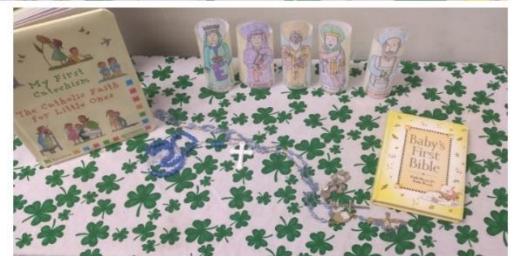
Pre-K's saints of the Week