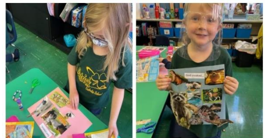
Kinder and their creation collages